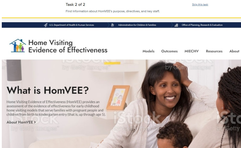
Exhibit 3. Example of first click testing interface

First click tests are used to test web page designs to ensure important page elements are easy to locate and interpret. Participants will be given a task and shown a clickable image of a web page and asked what they would click on first to complete the task (see Exhibit 3). This part of the test will focus on the HomVEE home and model search pages.