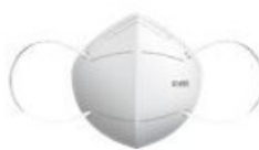
C. KN95 mask