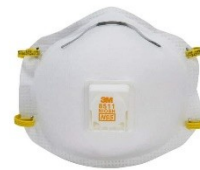
D. N95 disposable