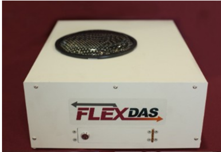
Figure 2. VTTI's FlexDAS

The FlexDAS can collect, encode, and encrypt eight 1080p high-definition video streams (see Figure 3 for example photos of demonstrating the FlexDAS' video quality). For this study, the FlexDAS will be integrated to collect data from the forward roadway simulation, the left- and right-side simulations, a driver facing camera, an over-the-shoulder camera, a remote operator facing camera (when appropriate), and a remote operator over-the-shoulder camera (when appropriate). The encrypted data are stored on a removable solid-state drive within the FlexDAS.