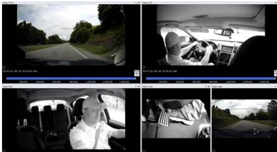
Figure 3. Example of High-quality Video from FlexDAS

The FlexDAS can collect, encode, and encrypt eight 1080p high-definition video streams (see Figure 3 for example photos of demonstrating the FlexDAS' video quality). For this study, the FlexDAS will be integrated to collect data from the forward roadway simulation, the left- and right-side simulations, a driver facing camera, an over-the-shoulder camera, a remote operator facing camera (when appropriate), and a remote operator over-the-shoulder camera (when appropriate). The encrypted data are stored on a removable solid-state drive within the FlexDAS.