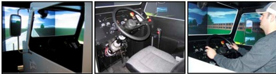
Figure 1. VTTI's CTAPS

The CTAPS (Figure 1; FAAC model TT-2000-V7) is a full-mission driver- and/or hardware-in-the-loop simulation tool. CTAPS allows VTTI to simulate multiple commercial vehicle types, including dump trucks and tractor-trailers with various trailer types, lengths, and load configurations. VTTI can produce interactive and programmable traffic and roadway environments (e.g., snow, rain, construction zones, and different levels of traffic densities), trigger vehicle malfunctions (e.g., front tire blowout and air pressure loss), and develop custom SCEs. CTAPS provides a 225-degree forward field of view along with two rear video channels that can be viewed through real west coast mirrors installed on the truck cab. CTAPS can also display an overhead (birds-eye) view of the training or scenario. All simulator hardware has been updated to current high-performance standards as of early 2021.