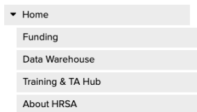
Screenshot 13: Task 8

You have decided to register as a HRSA grant reviewer. Where would you expect to be able to do so?