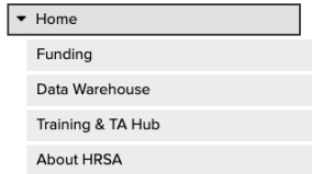
Screenshot 8: Task 3

After reading eligibility requirements for the upcoming grant funding opportunity titled "Pregnancy Medical Home Demonstrations" you are still not sure if your organization is eligible to apply. You want to contact someone to address your questions. Where would you expect to find contact information?