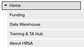
Screenshot 11: Task 6

Your organization's grant application has been under review for a couple months now. You want to learn what happens after HRSA selects the awardee. Where would you expect to find this information?