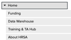
Screenshot 6: Task 1

You are a healthcare worker planning to apply for one of HRSA's loan repayment programs. Where do you expect to find information to help you determine if you qualify for any of HRSA's loan repayment programs?