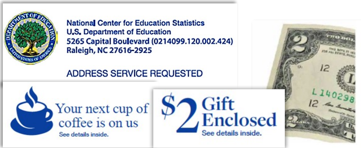
Figure 5. Sample envelope design details