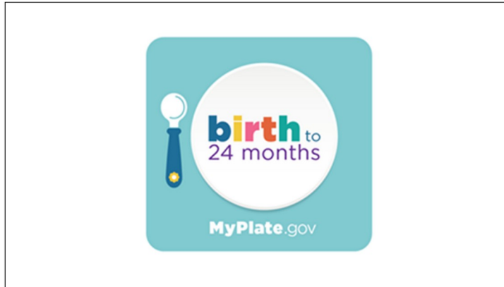
Image displayed on the computer screen during the focus group for participants to read and discuss.