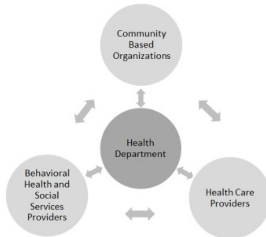
Figure 1. The health department, community-based organization(s), clinical care providers, and behavioral health and social services providers collaborate to provide comprehensive HIV prevention and care for MSM of color.