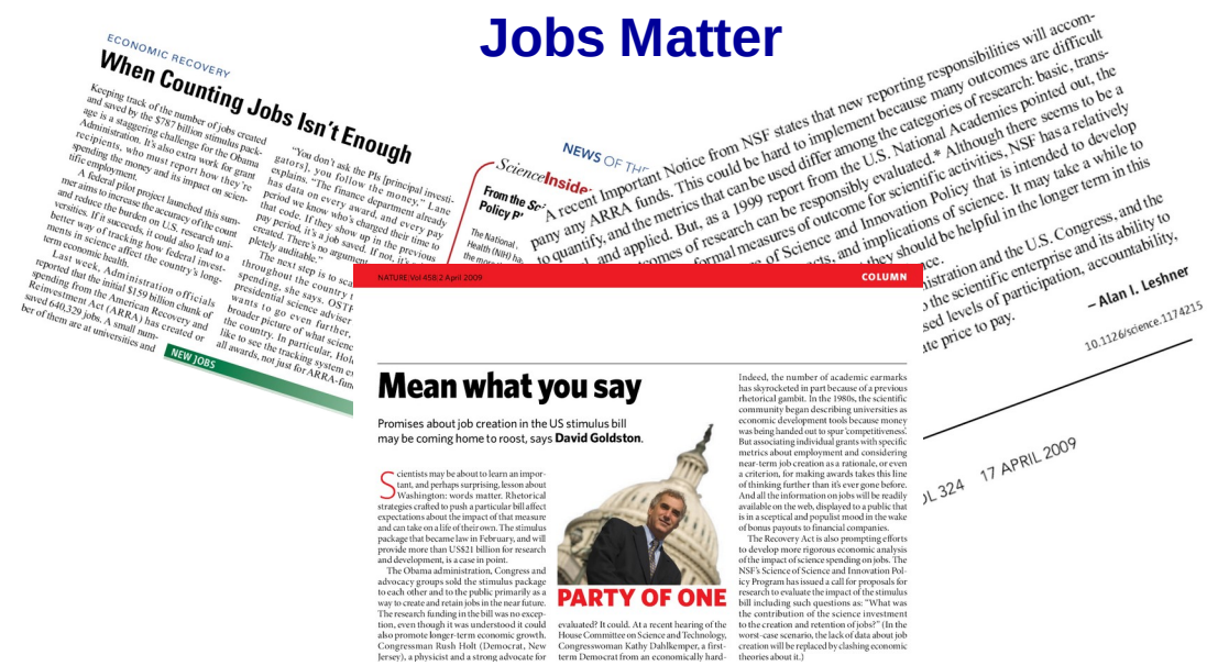
Figure 1: Articles in Science and Nature on science job creation

Use of the data The administration has committed to producing an open, transparent and auditable set of reports of the impact of ARRA on job creation. In addition, as noted in Figure 2, the media has asked important questions about the impact of federal investments in science, particularly with respect to job creation and economic growth. It is important to collect and analyze data so that such questions can be answered in a credible fashion. There is currently no data infrastructure that systematically couples science funding with outcomes.