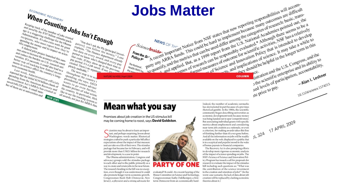
Figure 1: Articles in Science and Nature on science job creation

Use of the data The administration has committed to producing an open, transparent and auditable set of reports of the impact of ARRA on job creation. In addition, as noted in Figure 2, the media has asked important questions about the impact of federal investments in science, particularly with respect to job creation and economic growth. It is important to collect and analyze data so that such questions can be answered in a credible fashion. There is currently no data infrastructure that systematically couples science funding with outcomes.